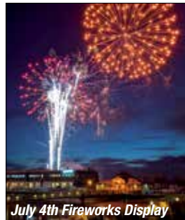
July 4th Fireworks Display