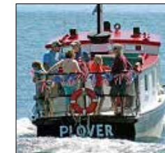
Plover Passenger Ferry

Details visit: www.draytonharbormaritime.com