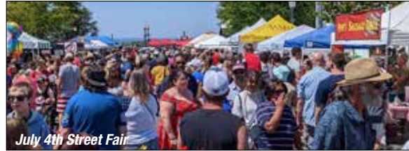
July 4th Street Fair