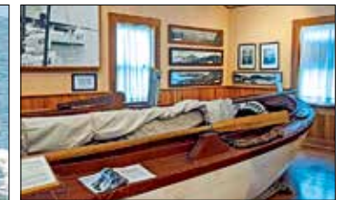
Alaska Packers Association (APA) Museum

Visit the Alaska Packer Association Museum in Semiahmoo Park. The museum consists of artifacts telling the history of the old cannery days in the 1890s on Semiahmoo Spit. Today, Semiahmoo Resort sits on the backbones of the old cannery.