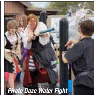
Pirate Daze Water Fight

Events are big in our small town! Check out all our year-round events at: blainebythesea.com