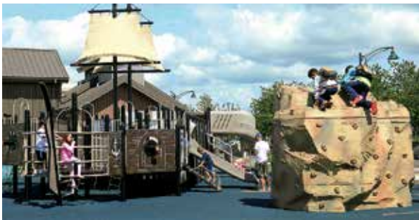
Blaine Marine Park Playground

Marine Park 272 Marine Drive 7-acre waterfront park, wildlife viewing, picnic area, state of the art maritime playground, trails, pocket beaches.