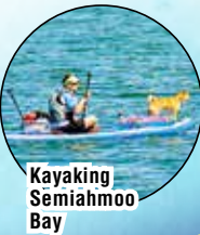
Kayaking Semiahmoo Bay