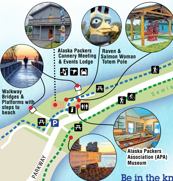
Antique machinery used in the canning of salmon

Pause by the Semiahmoo Marina breakwater and watch harbor seals surface with curious eyes. These playful residents are often spotted between Semiahmoo Wharf Pier and Jorgensen Public Pier, offering unforgettable moments for wildlife lovers. Remember to keep a respectful distance—binoculars let you enjoy close-up views while giving the seals plenty of space.